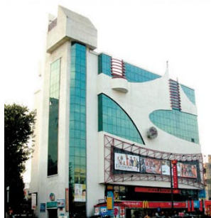
City Gold Multiplex

'mFV-AC', is a ready mix of Vermiculite, special polymers, binders and white/grey cement. This is widely used for acoustic treatment with highly satisfactory results. Upto 30mm thickness in multiple layers can be applied to walls, ceilings by either manually / mechanized.