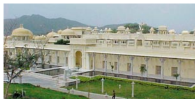
Uday Vilas Palace