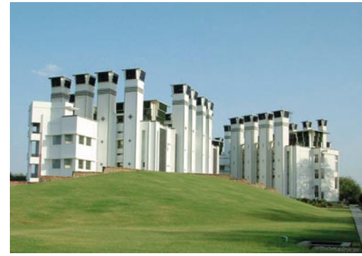
Torrent Research Center